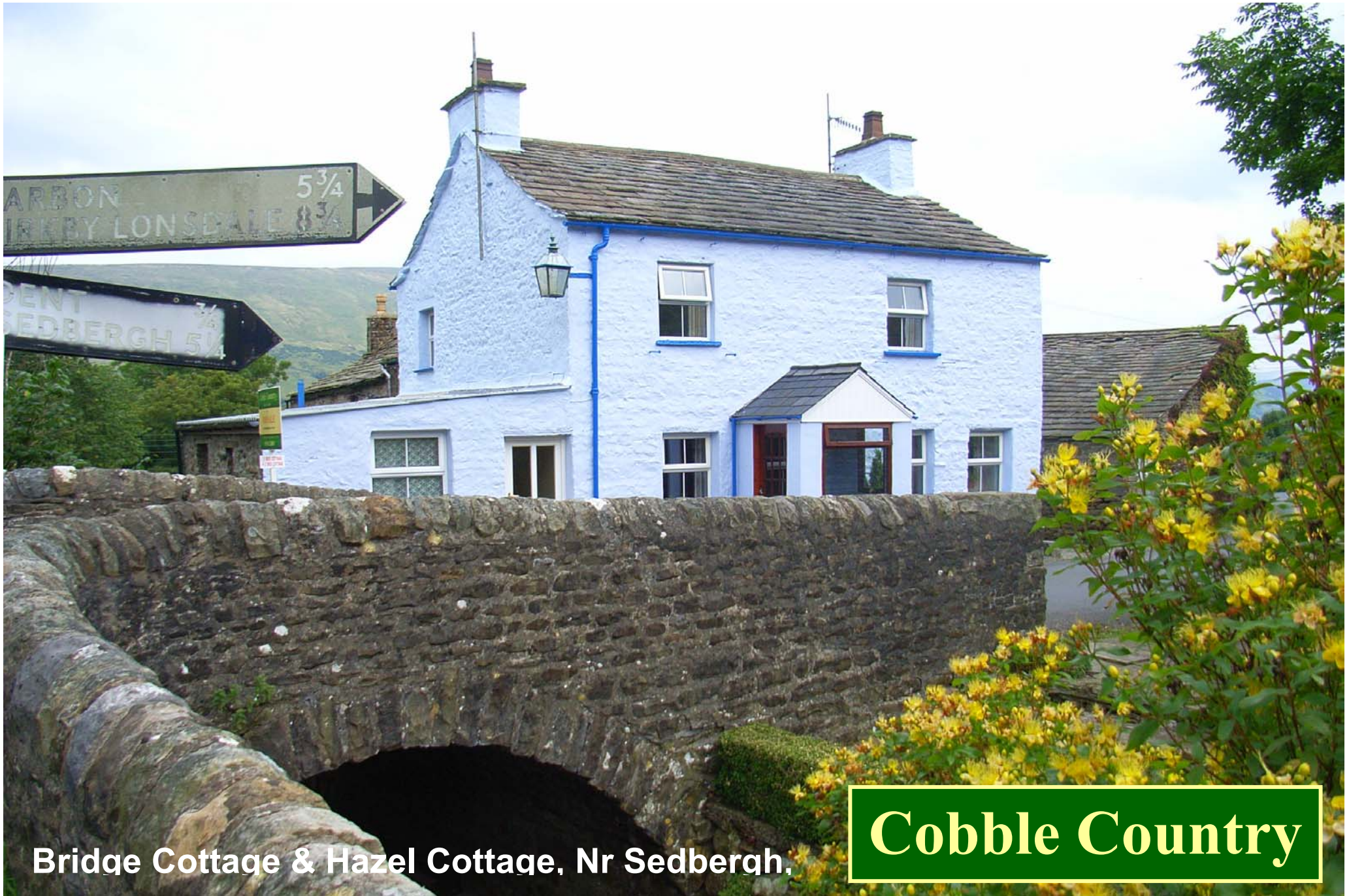
Bridge Cottage & Hazel Cottage, Nr Sedbergh,